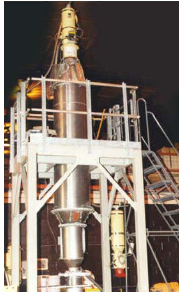
Blender Lab Test Unit