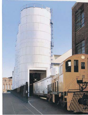
Skirted Rail Drive-Thru Silos