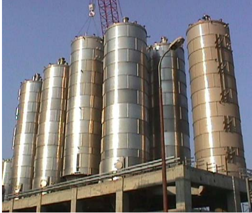
SealWeld™ Silo Complex