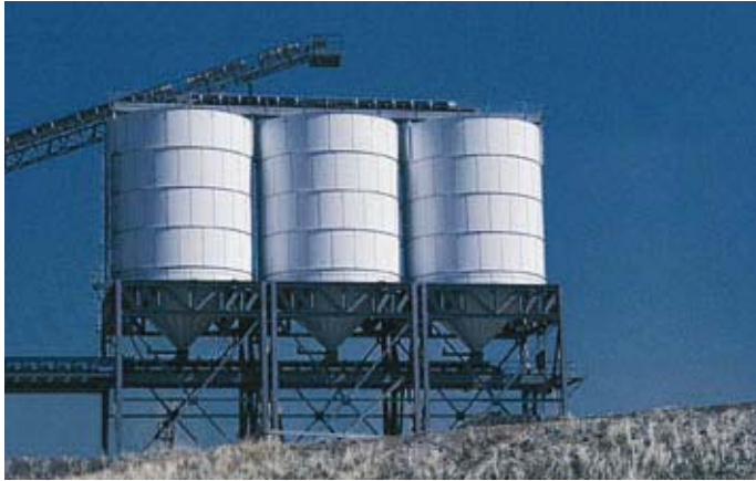
Cone Bottom Silos on Structural Supports