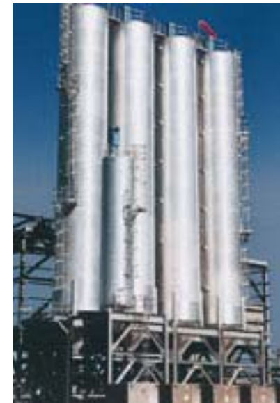
Shop Welded Aluminum Silos