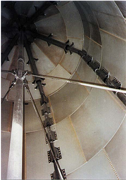
Gravity Blender Internal View