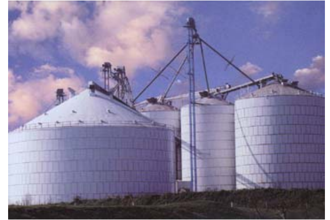
Large Diameter Flat Bottom Silos