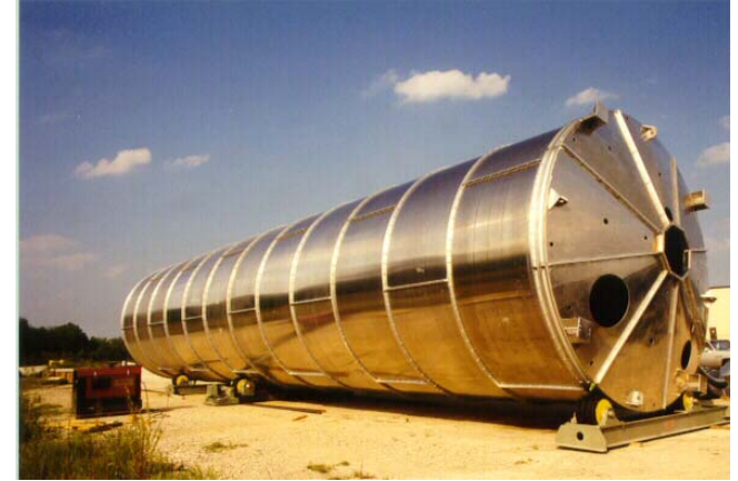
SealWeld™ Silo Ready for Placing