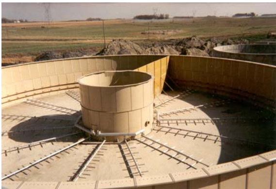
Open Top Concentric Tanks with Steel Floor