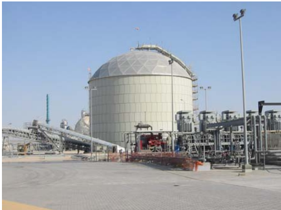
Flat Bottom Dome Roof Silo