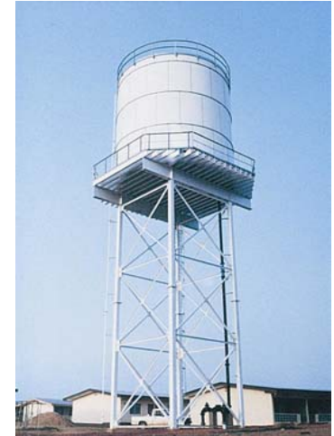
Tank on Steel Tower