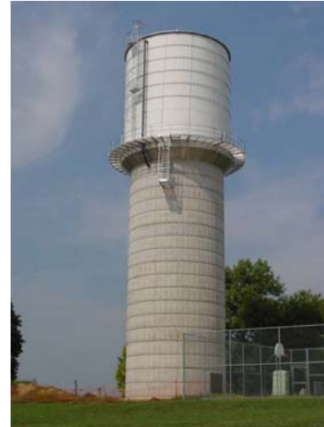
Tank on Concrete Tower