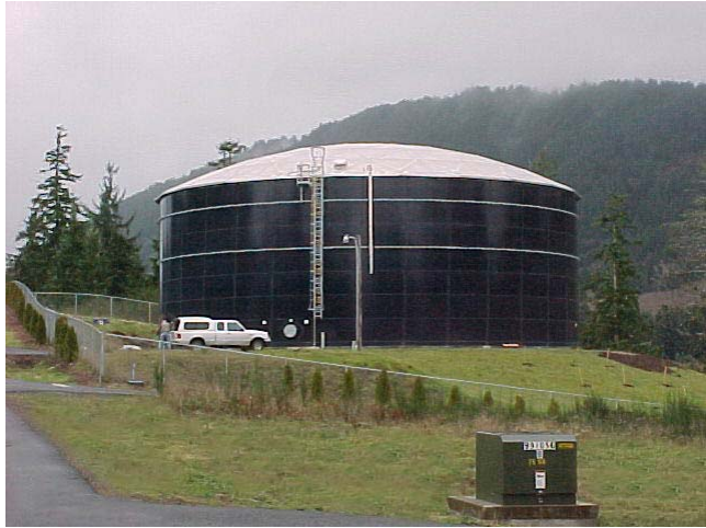
Reservoir with Dome Roof