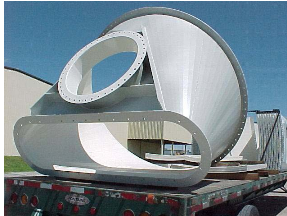
Custom Designed & Fabricated Hopper Outlet Section